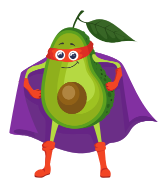
Avocados are a smile super food! They contain folic acid and potassium for healthy teeth and gums.<sup>2</sup>

Dental anxiety affects about 36% of the population.<sup>1</sup>