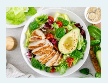
Healthy Recipe: Grilled Chicken with Homemade Dry Rub