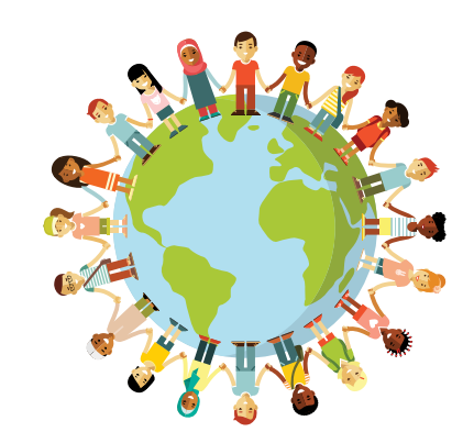
The human mouth contains more bacteria than there are people on Earth.3