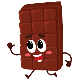
A smile can generate the same level of brain stimulation as up to 2,000 chocolate bars.1