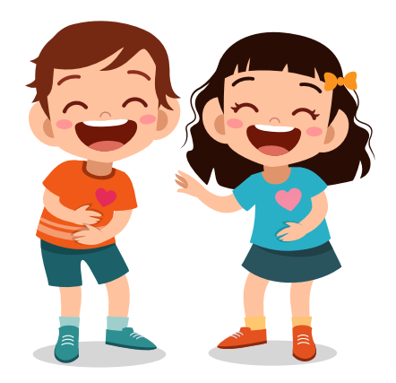
Laughing is good for your heart. It reduces stress and gives your immune system a boost.<sup>1</sup>