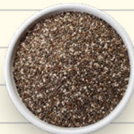
2 tablespoons chia seeds