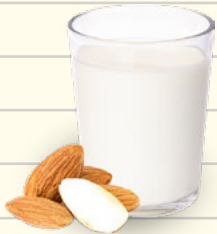
1 cup almond milk