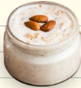
½ cup almond yogurt (look for the lowest sugar version)