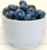
1 cup blueberries