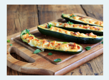
Healthy Recipe: Cheesy Barbecue Chicken Zucchini Boats