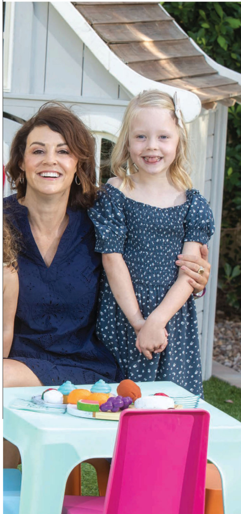
JIM POULIN | PBJ