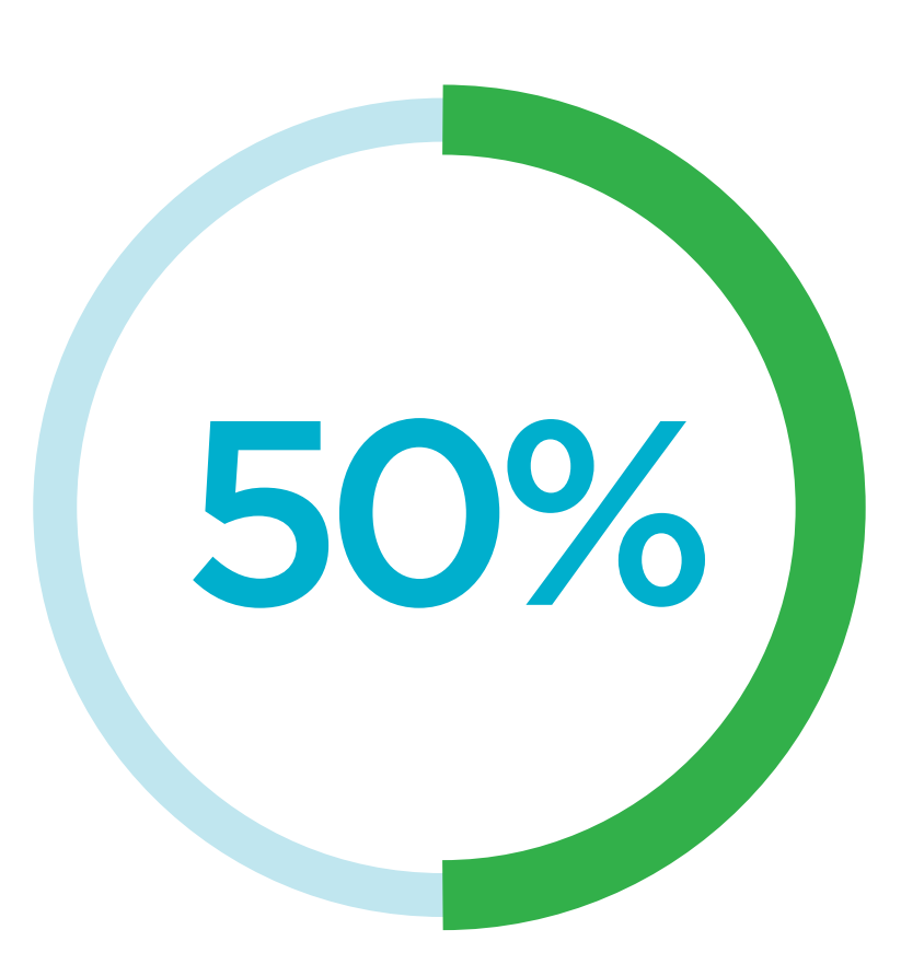
have improved their at-home oral care.

are more likely to make full use of their dental insurance benefits.