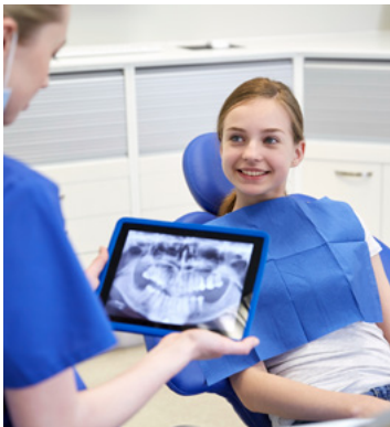
IMAGE GENTLY DURING CHILDREN'S DENTAL PROCEDURES

Delta Dental of Arizona 5656 W. Talavi Blvd. Glendale, AZ 85306